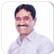
Chandrakant Dalvi Cooperative Commissioner, Maharashtra, Government