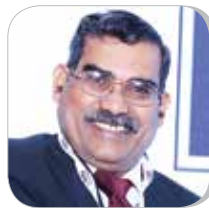
A P Hota CMD, NPCI