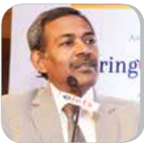
K Shivaji CMD, SIDBI